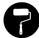
PAINT ROLLER & TRAY