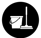
SPONGE MOP & BUCKET