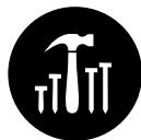
HAMMER & NAILS